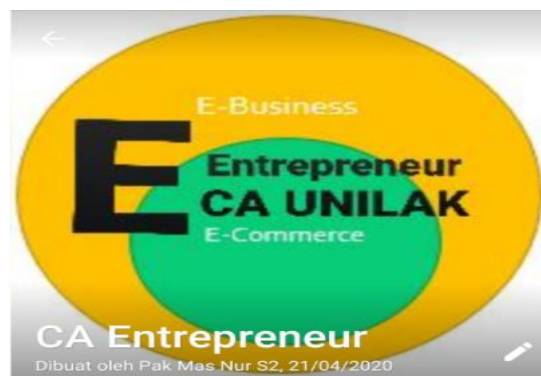
Figure 1. Technology of Entrepreneurship at Whatsapp

Entrepreneurship that is carried out by students comes from several faculties in Unilak, for example from the economics faculty, engineering faculty and teacher science and education faculty. Many student entrepreneurial results have succeeded in reaching the national level, for example the Kopertis X level (LLDIKTI X) even up to the national level Kopertis level. However, from the results of student entrepreneurship there are still not many that have been developed, because many activities are carried out manually and even manually. Apart from the lack of use of technology, students are also caused by the business capital they get. The capital that students get as long as they are obtained from their own expenses and jointly with other students who are in the same group with students. So that it causes their business to be less developed, the results of their business are less known by the people inside and outside the Unilak campus. There has been much done by the University to spur the creation of young entrepreneurs on campus, but as a business incubator it is still not optimal in terms of sharing, namely not providing office facilities that can be used together, such as receptionists, conference rooms, telephone systems, fax, computers, & security and Synergy, namely the tenant cooperation or competition between tenants and networks with universities, research institutions, private businesses, professionals and the international community has not been created.