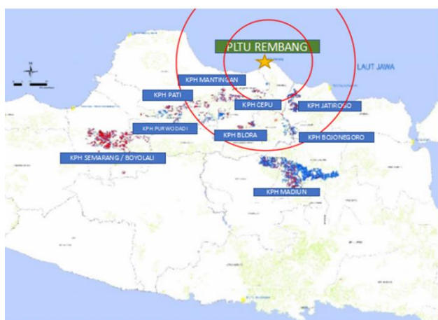
Figure 1. Potential HTE belonging to the Central Java Cluster Perhutani

Mapping the potential of biomass by looking for sources to fulfill the supply of sustainable biomass supply up to a radius of 100 km from the power plant. So that the distance from the feedstock to the Coal-Fired Power Plant is not far enough and can make the price of biomass cheaper. This will ensure the continuity of the supply of feedstock needed by the Coal-Fired Power Plant. For the results of energy plantation forest products that can be used as fuel for Coal-Fired Power Plant boilers. In this study, a geospatial analysis of the potential distribution of energy plantation forest belonging to Perum Perhutani has been carried out. Perum Perhutani as one of the forest companies that manages state forest areas in Java Island has prepared for planting energy plantation forests. This analysis is carried out by using the process of overlaying some data from the RBI (Rupa Bumi Indonesia) map obtained through the Indonesian Bakosurtanal Agency, where currently the data can be downloaded for free through the Geoportal Indonesia website. As shown in figure 1. there are several Forest Management Units (KPH) Perum Perhutani that can support the supply of biomass to CFPP Rembang, namely KPH Mantingan, KPH Blora, KPH Pati and KPH Cepu.