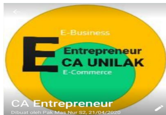
Figure 1. Technology of Entrepreneurship at Whatsapp

namely the tenant cooperation or competition between tenants and networks with universities, research institutions, private businesses, professionals and the international community has not been created.